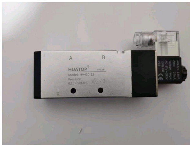
HUATOP 4V410-15 Solenoid Valve