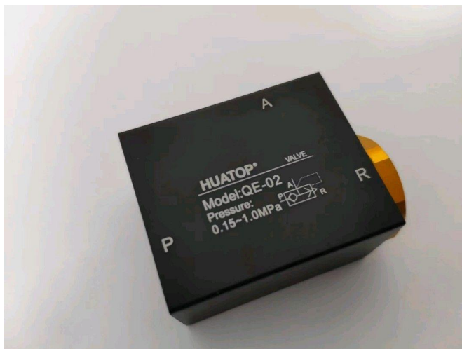
HUATOP Valve QE-02