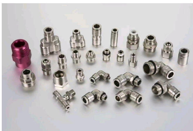
HUATOP Brass Fittings